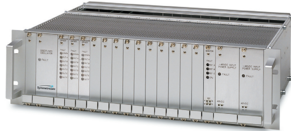
56000 Modular Time & Frequency Distribution System (Front View)